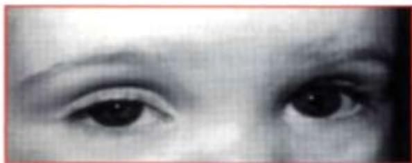
Horner's Syndrome in a baby with T1 avulsion.