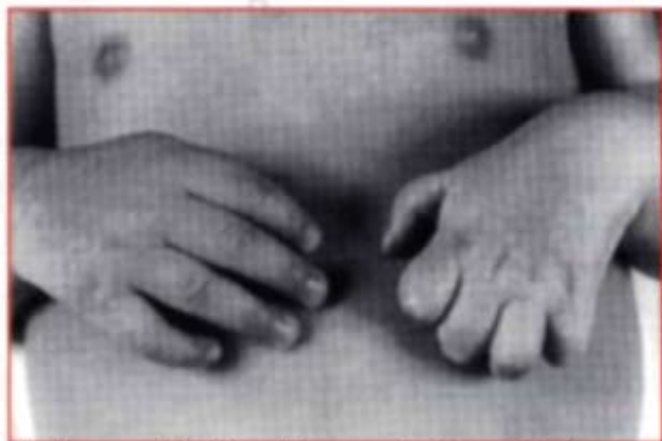
A six month old with a total plexus lesion from birth.